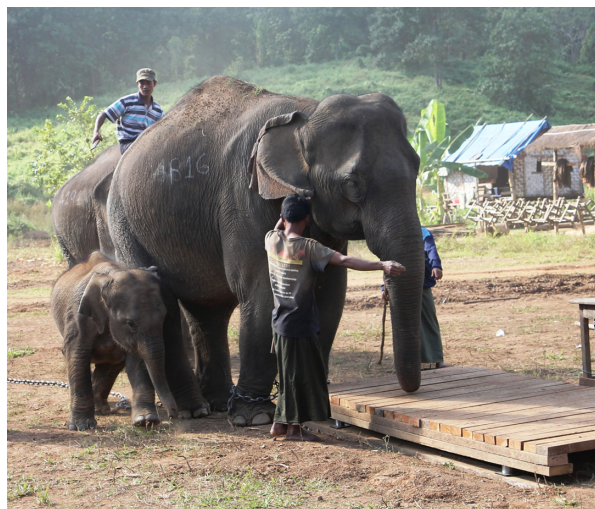
Figure 1. Asian elephant ( Elephas maximus ) female and her calf. Pan Cho Lwin, born on 3 April 1977, is shown with her fourth calf; two older female offspring are still alive, while a male died at age 8 months. Both mother and offspring are being longitudinally weighed and measured as part of the Myanmar Timber Elephant Project.

Asian elephants ( Elephas maximus ; Fig. 1) are characterized by long gestations of around 22 months (Lueders et al. 2012) and an extended infant dependency period of up to 6 years (Fowler and Mikota 2006). They inhabit regions characterized by a seasonal climate, which has been shown to influence mortality rates (Mumby et al. 2013). In addition, this species includes large populations of working elephants that also face the possible effects of seasonal work schedules. They are for this reason a relevant system for studies of effects of seasonal variation on birth timing and short- and long-term mortality of calves, with results that could be applied to management practices. Due to paucity of longitudinal data on Asian elephants, it is not clear whether there is a seasonal pattern of births in wild or captive Asian elephants, or whether females time conceptions or births to the most favorable periods of the year in terms of offspring survival. Two studies of elephants in India found signs of birth seasonality and a peak of births in January: logging elephants in the south (Sukumar et al. 1997), and